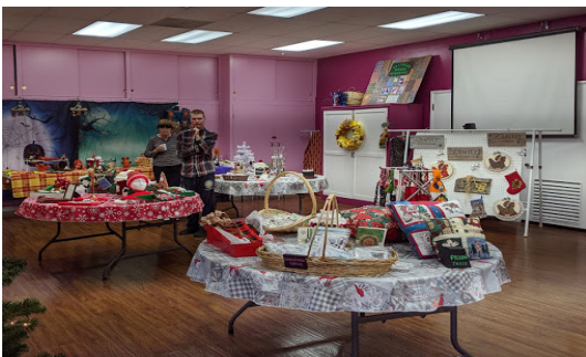
Goodies on sale at the Boutique.